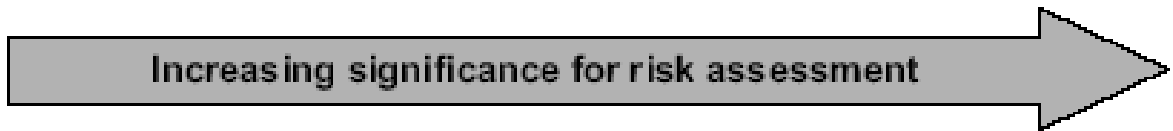
1. Scheme of ambient and biological monitoring (modified acc. DFG, 2002; Angerer and Gündel,